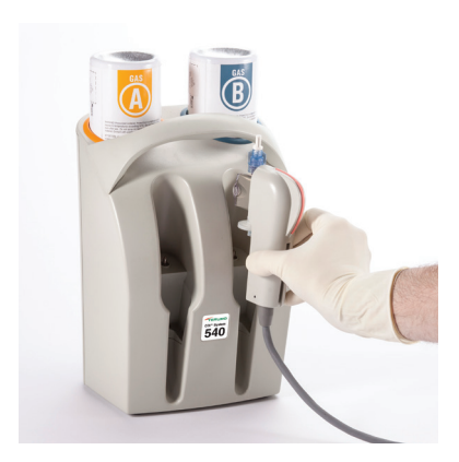
The cable head, with sensor attached, is placed in the calibrator.