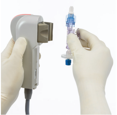
The shunt sensor is placed in the cable head.