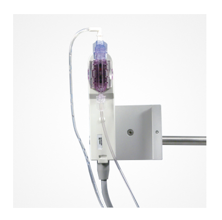
The sensor and probe head are installed in the circuit with two luer connections. The design allows placement in a variety of circuit locations.

Learn why the world's leading Cardiac Centers have trusted Terumo's CDI Systems for more than 30 years.