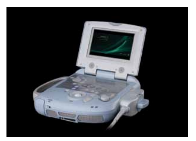
Converts from a full featured cart based console into the Scan Engine, a 5½ lb. hand-held console without sacrificing performance.